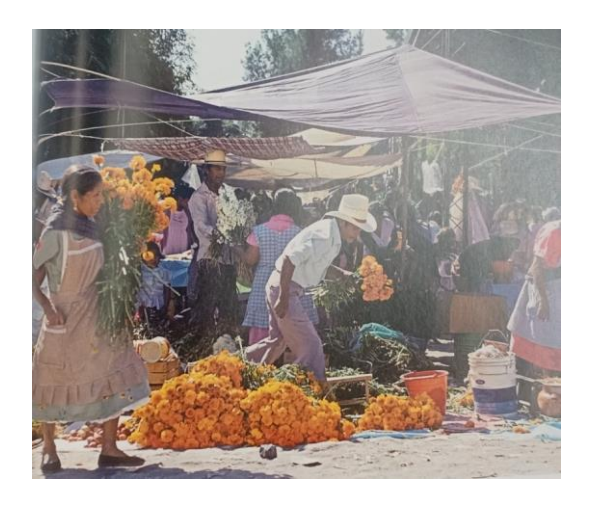
Figure 4 Villagers buy flowers from a yearly market for the day of the dead in Huaquechula, Puebla state, 1989. (Sayer, 2009: 109)