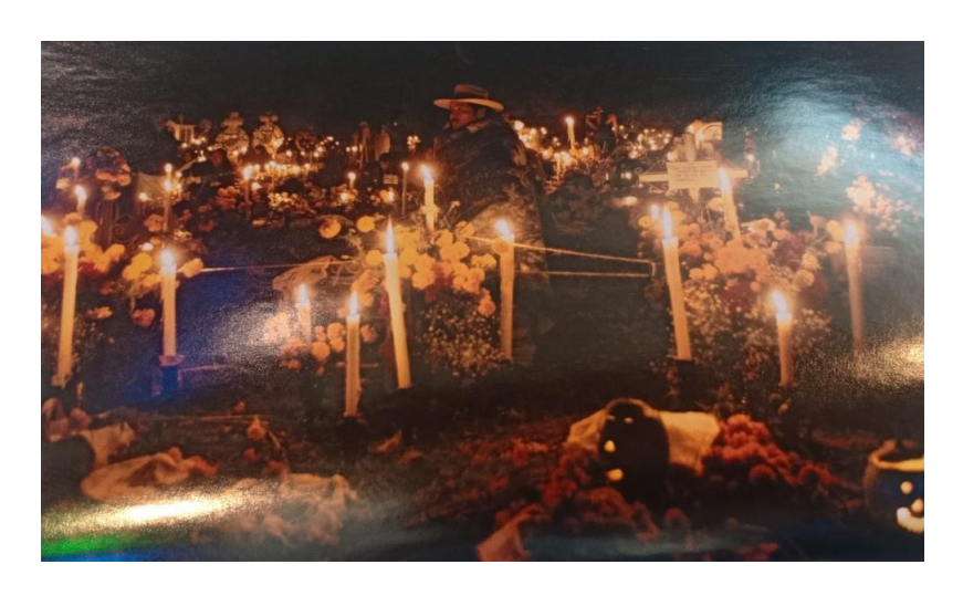
Figure 6 Candles and flowers on the cemetry (Brandes, 2006: Pl. 6.3)