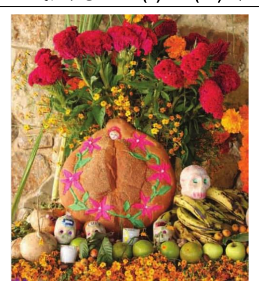
Figure 3 Some offerings of fruits and flowers for the dead (Williams, Mack, 2011: 28)