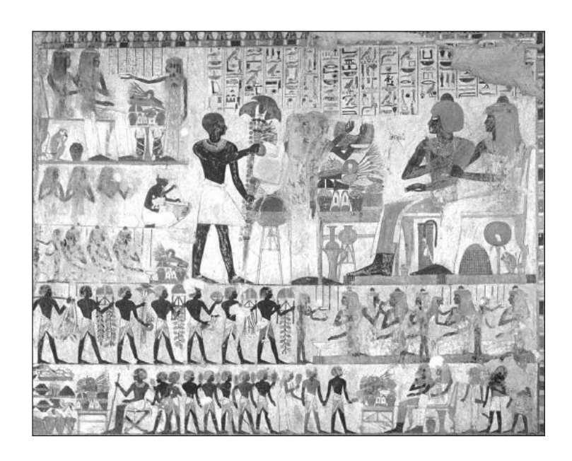
Figure 1 A banquet scene from Userhat tomb (TT 56), Sheikh Abd El- Qurna, Eighteenth Dynasty; Location of the scene: The southern wall of the vestibule hall. (Harrington, 2013: Fig. 45).