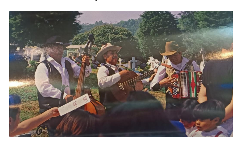
Figure 5 Musicians are playing music during the day of the dead festival (Brandes, 2006: Pl.1.2)